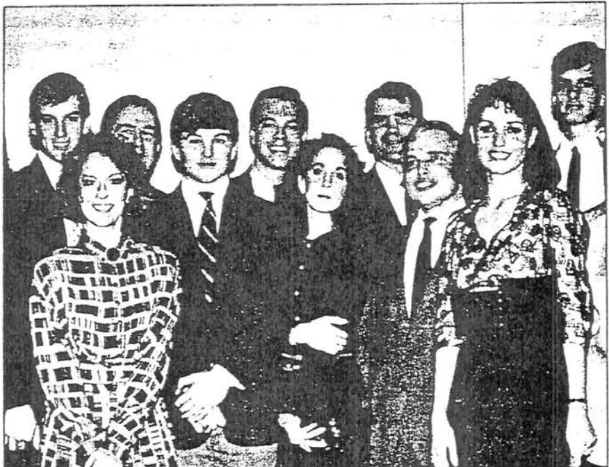
YCT Reception: YCT members pose for a picture with Oliver North at a reception in the Houstonian Hotel.